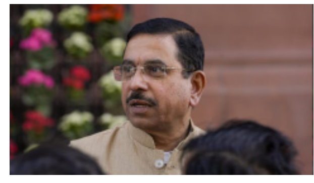
EMS News Agency, March

Union Minister for Parliamentary Affairs Pralhad Joshi lashed out at the Congress, saying the party had no moral right to speak about corruption. He was reacting to the Congress party's demand for Chief Minister Basavaraj Bommai's resignation over the arrest of BJP MLA Madal Virupakshappa's son by the Lokayukta. "The Congress has no moral right to speak about corruption.